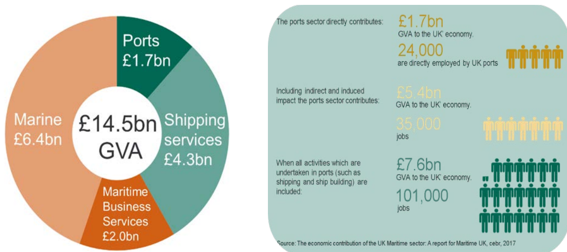
Figure 1 Maritime and ports sector contribution to GVA (2016)