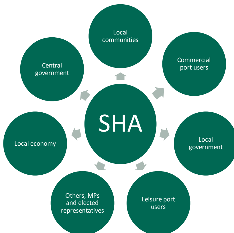
Figure 3 SHA and stakeholders